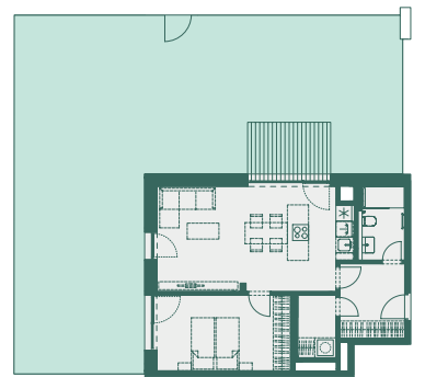
Actual garden proportions